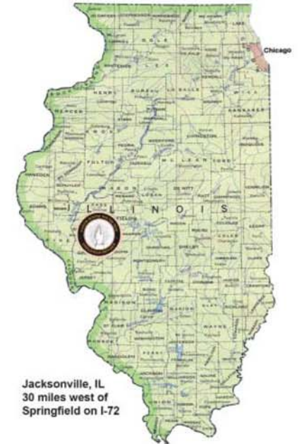
Jacksonville, IL 30 miles west of Springfield on I-72

http://nad.org/issues/technology/assistive-listening/cochlear-implants NAD Position Statement on Cochlear Implants (2000)